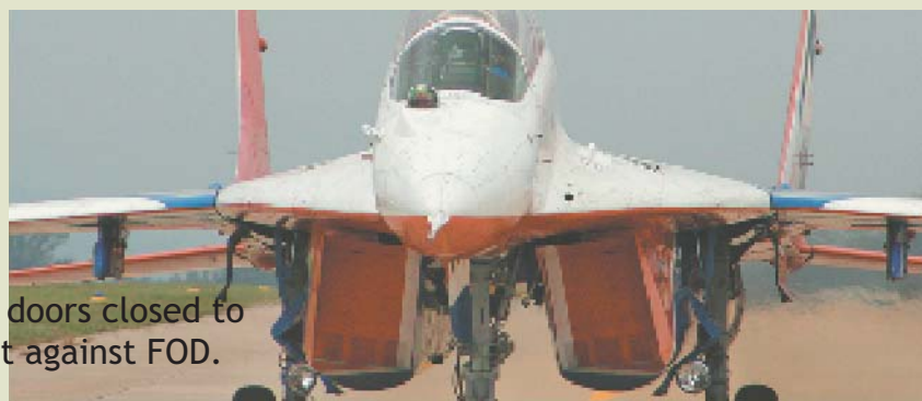
Intake doors closed to protect against FOD.

FOD is a human based issue. Technology will not adequately reduce the incident rate. It takes human involvement to solve this problem.